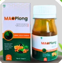
Honey Herbs (MAGPLONG)

As with other ginger preparations, ginger candy also has many good health benefits because ginger can increase the body's immunity, relieve inflammation and digestive problems, and reduce symptoms of colds.