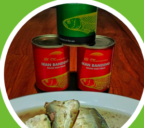
Milkfish In Canned

The ingredients are: forest honey, black cumin, turmeric, licorice root, spirulina, sembung leaves, bitter leaves, mint leaves.